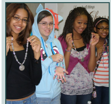
Jewelry Making Workshop