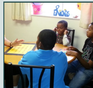
Wisdom of God Youth Workshop

Which road will you take, the wide road or the narrow road?