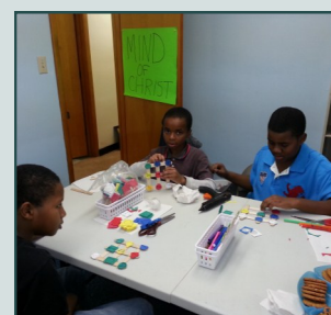
Wisdom of God Youth Workshop