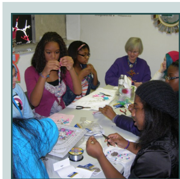
Jewelry Making Workshop

Our gifts are to be used for God's glory and not to be set on the shelf and collect dust or rust and lose value. Start today, allow your gifts and talents serve their purpose for the Kingdom of God.