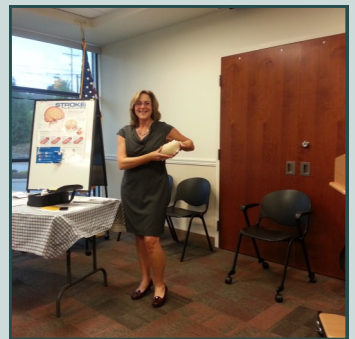
Health Awareness Workshop