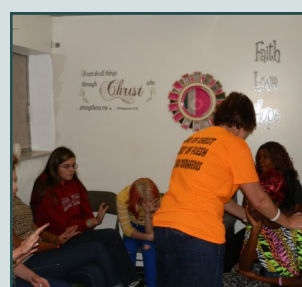
Wisdom of God Youth Workshop