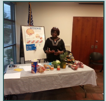
Health Awareness Workshop