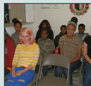
Wisdom of God Youth Workshop