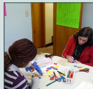
Wisdom of God Youth Workshop