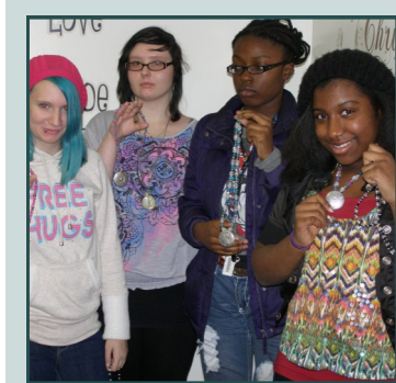
Jewelry Making Workshop