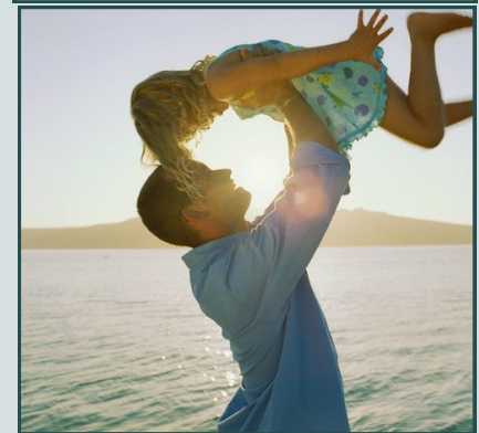
"Family is Relationship"