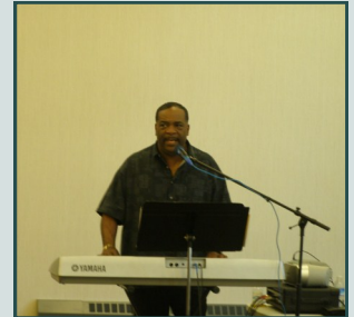
Worship Concert June 2012