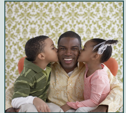
"Father is Love"