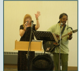
Worship Concert June 2012