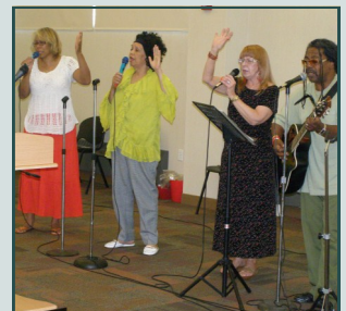
Worship Concert June 2012