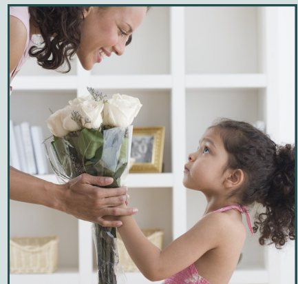
"Mom is Special"