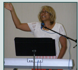
Worship Concert June 2012