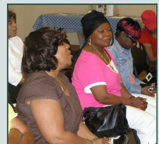
Worship Concert June 2012