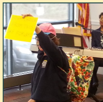
2013 in Review