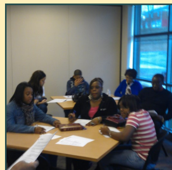
2013 in Review

But...you shouldn't just always think of what God can do for you. I figure God put me here and he can take me back anytime he pleases. And...that's why I believe in God.