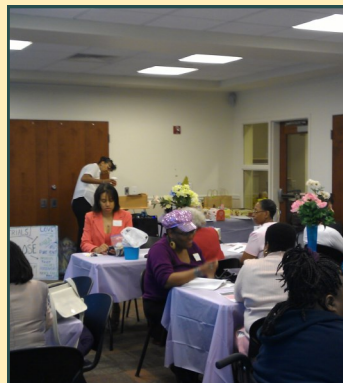
2013 in Review