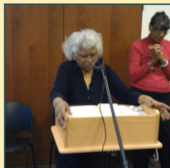
2013 in Review