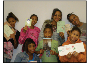
A Monthly Meeting

412-731-3450 or email journeylife@verizon.net for more information.