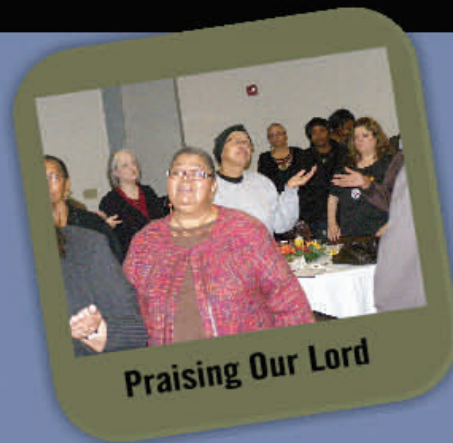
Praising Our Lord

The Women's Conference was a success! Women from all walks of life and culture came together to "praise and worship" our Lord and Savior. God was faithful and many women's lives were changed that night.