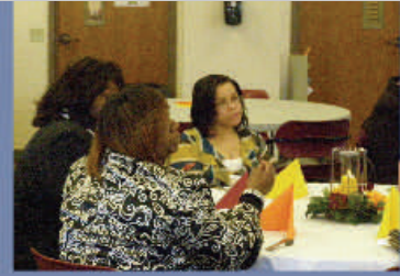
Women On A Journey