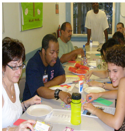
Para Hands Class doing crafts

It's a joy to see these individual's faces light up knowing there is a God who cares about them and loves them unconditionally.