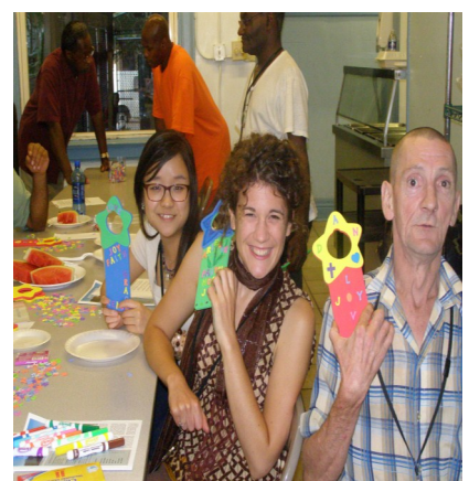
Para Hands Class finished product!