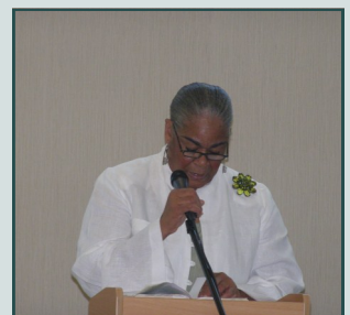
Worship Concert Sept. 2011