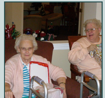
Community Day With the Seniors