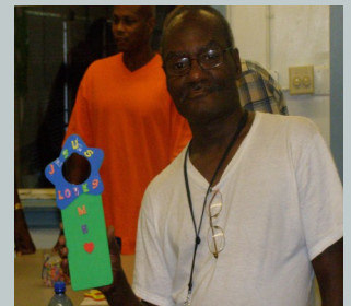
“Homeless Shelter Ministry”