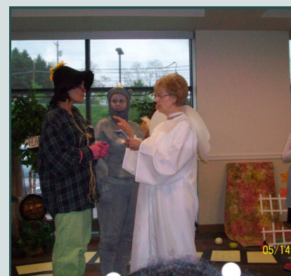
“Wisdom of God Production”