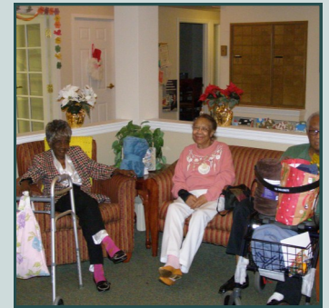
Community Day With the Seniors