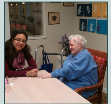
Community Day With the Seniors