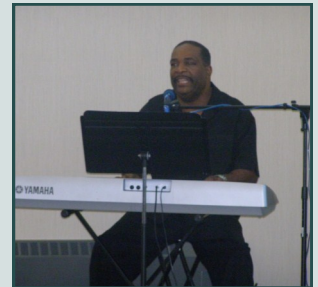
Worship Concert Sept. 2011

Did you know one of the ways to determine if you love God according to I John, we must love our brother first (fellowman) - ( I John 4:20-21 )