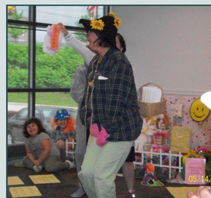
“Wisdom of God Production”