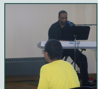
Worship Concert Sept. 2011

gdecor Decorating & Catering Weddings & All Occasions