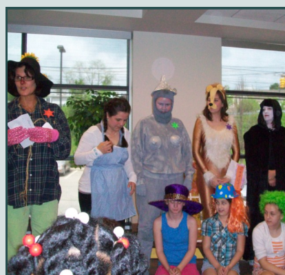
“Wisdom of God” Production At Virtuous Women’s Monthly Meeting