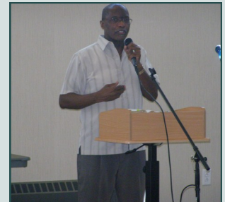
Worship Concert Sept. 2011