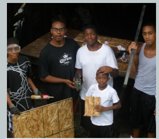
“Youth Workshop Day”

Step 12: Keep busy at something. A busy person never has time to be unhappy. God has plenty for us to do—Father God says in Matthew 9:37 “..... ‘The harvest truly is plentiful, but the laborers are few.’ Become a ‘laborer for God, the rewards are wonderful.’”