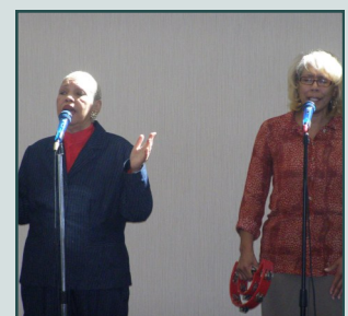
Worship Concert Sept. 2011