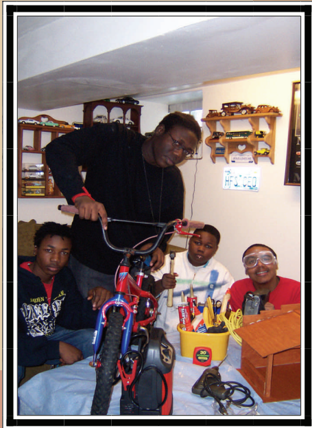
Bicycle Repair Project