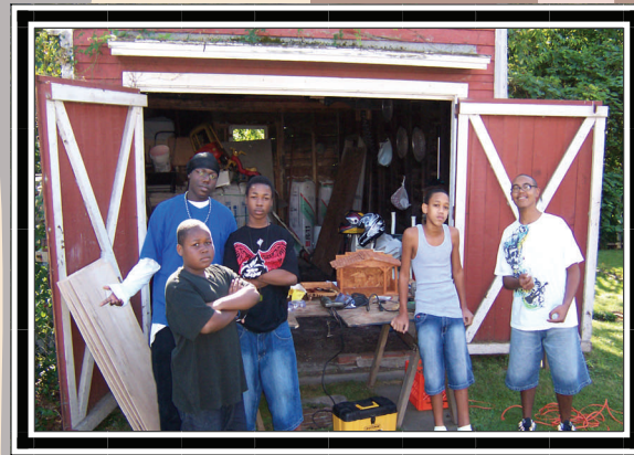
Wood crafting project. Making mangers for gifts

Visit our website at: www.journeythroughlife.net