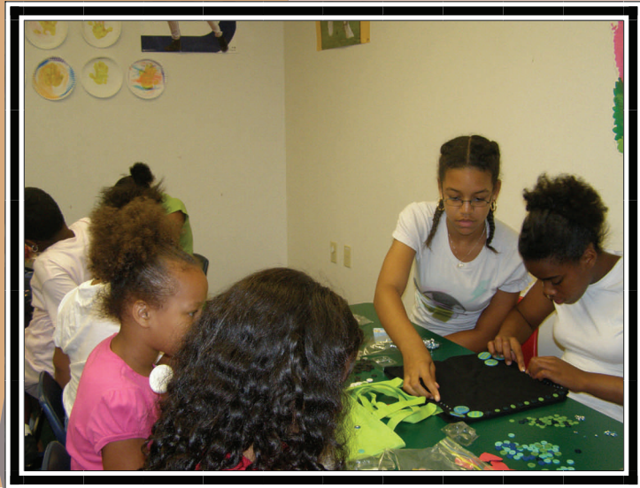
Virtuous Teen Girls designing tote bags as a life skill project.